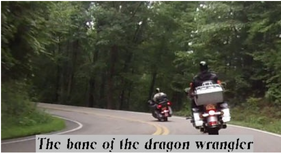
The bane of the dragon wrangler

For a while, at least, as before too long I caught up with traffic – two non-Miatas and two touring motorcycles. The cars soon found pull-off spots and let me by. But the motorcycle riders, as they tend to be, were more stubborn, and it wasn't until several minutes later that they finally yielded.